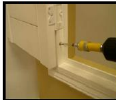
Pre-Drill bottom right & left frame.