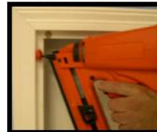
Only secure one screw into the top left frame.