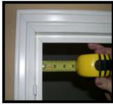
Measure Right & Top frame for spacing.