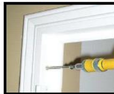
Only secure one screw into the top left frame.