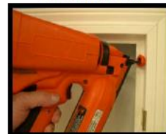
Only secure one screw into the top right frame.