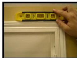
Level the top frame.