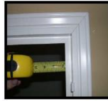
Measure Left & Top frame for spacing.