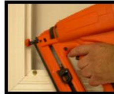
Only secure one screw into the bottom right frame.

DOUBLE CHECK AND MAKE SURE PANELS ARE STILL EVEN ACROSS THE TOP