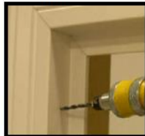
Pre-Drill top right & left frame.