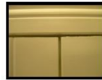
After racking of shutter, panels should line up.

12. Once the panels are lined up, nail/screw at the bottom of the left frame below the hinge.