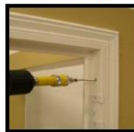
Only secure one screw into the top right frame.