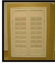
Slide panel into frame hinges and close other panel to hold in place.