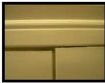
Once you have installed the panels, and they do not line up,

11. Once panels have been positioned and secured with the hinge pins, make sure shutter panels are even across the top and bottom. If panels are not even, shift (rack) your frame left to right until your reveal is even.