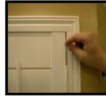
Insert hinge pin.

11. Once panels have been positioned and secured with the hinge pins, make sure shutter panels are even across the top and bottom. If panels are not even, shift (rack) your frame left to right until your reveal is even.