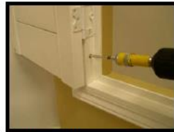
Only secure one screw into the bottom right frame.