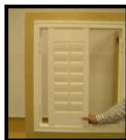
Position panel in the frame.