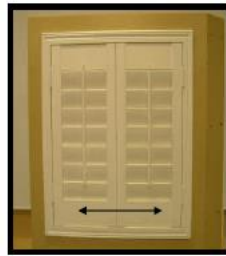
RACK the bottom of your frame to the left or right for an even reveal.