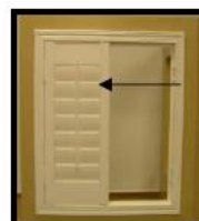
Slide panel into frame hinges.