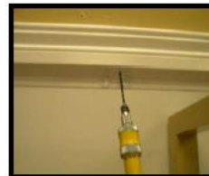
Pre-Drill middle of top and bottom frame.

Tip: Use a counter sink bit for best results.