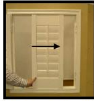
Position panel in the frame.

10. Place the right shutter panel(s) in the frame, slide into position, insert hinge pins into hinges.