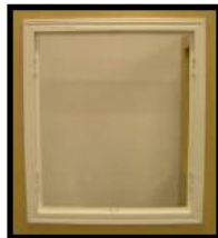
Frame EVENLY in the window.